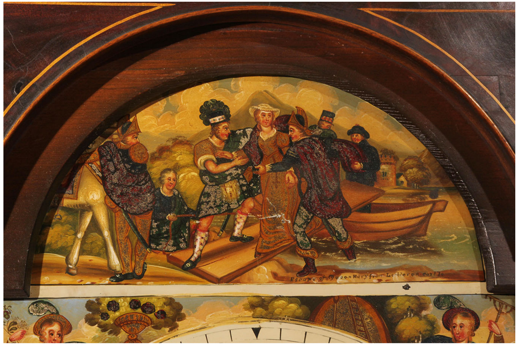
Early 19th century English tall case clock with Mary, Queen of Scots themed dial