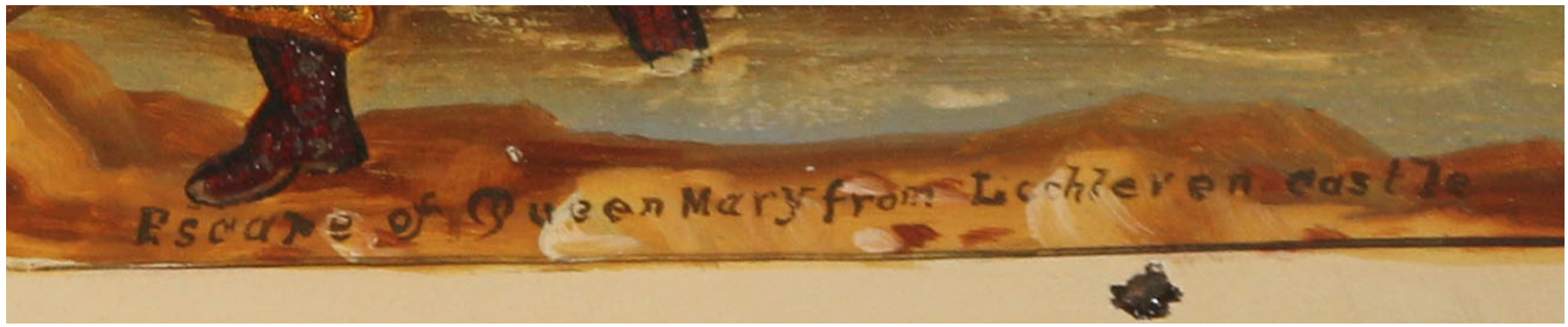
Early 19th century English tall case clock with Mary,Queen of Scots themed dial