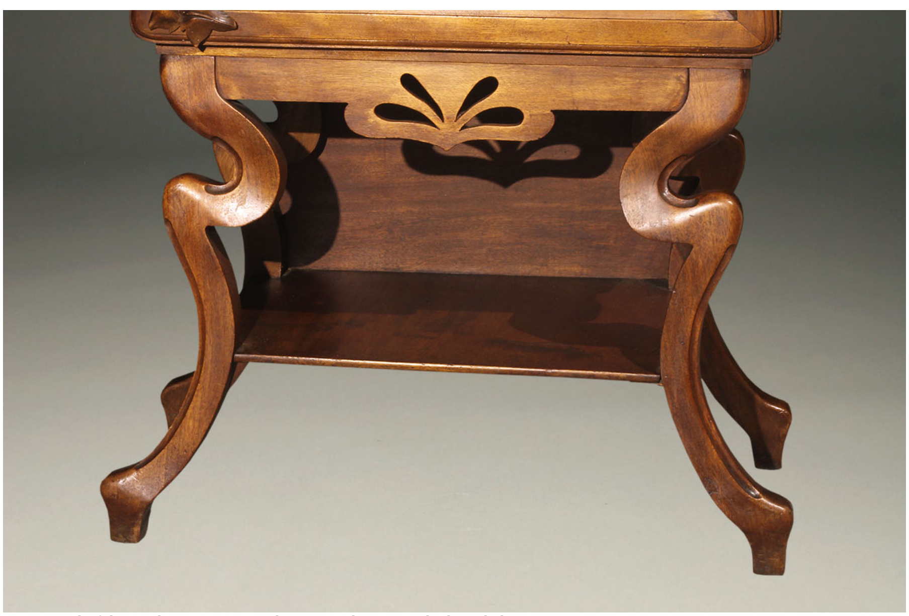
Wonderful French Art Nouveau cabinet in mahogany with glass shelves