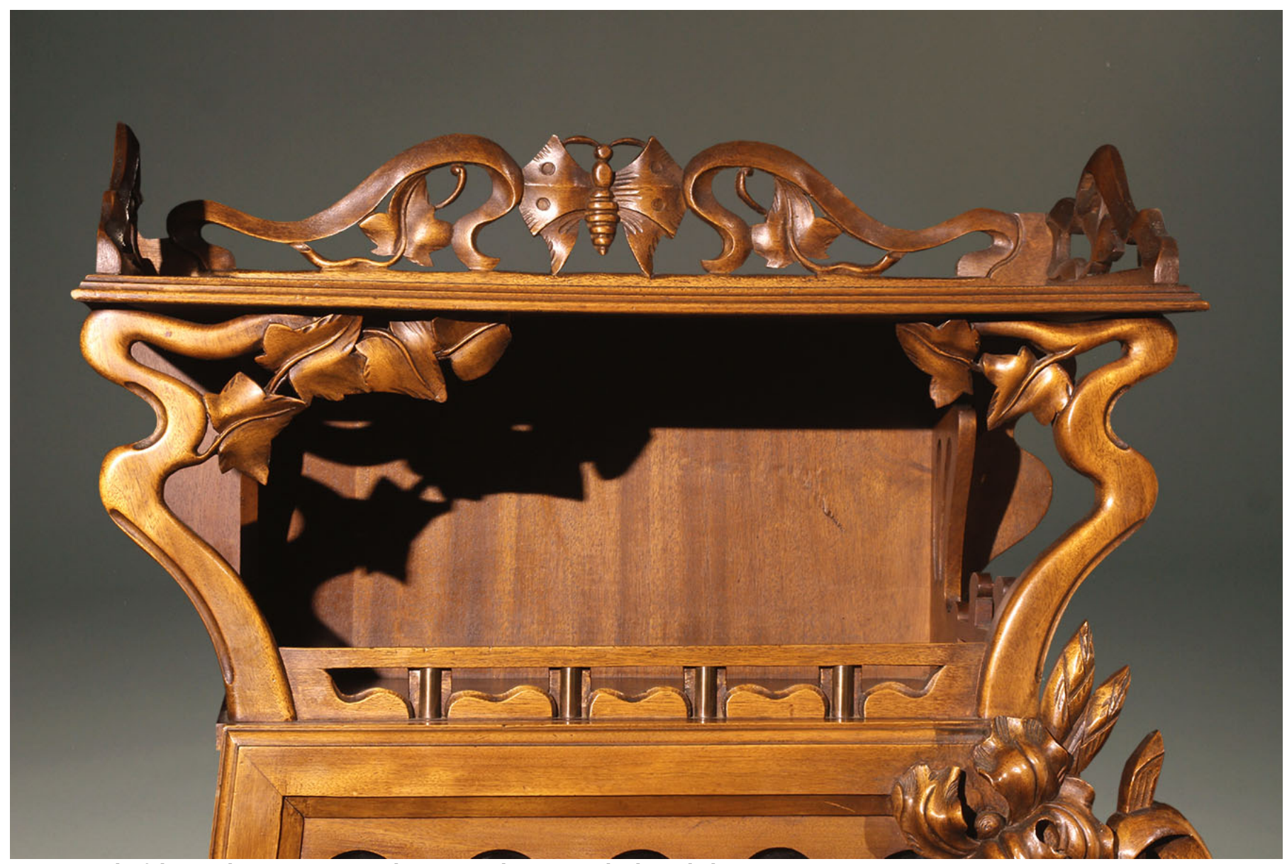
Wonderful French Art Nouveau cabinet in mahogany with glass shelves