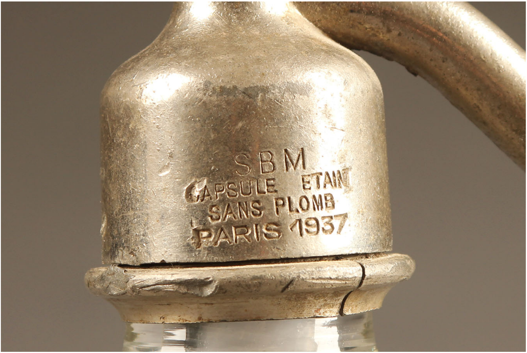
Clear seltzer water bottle from France dated 1937.