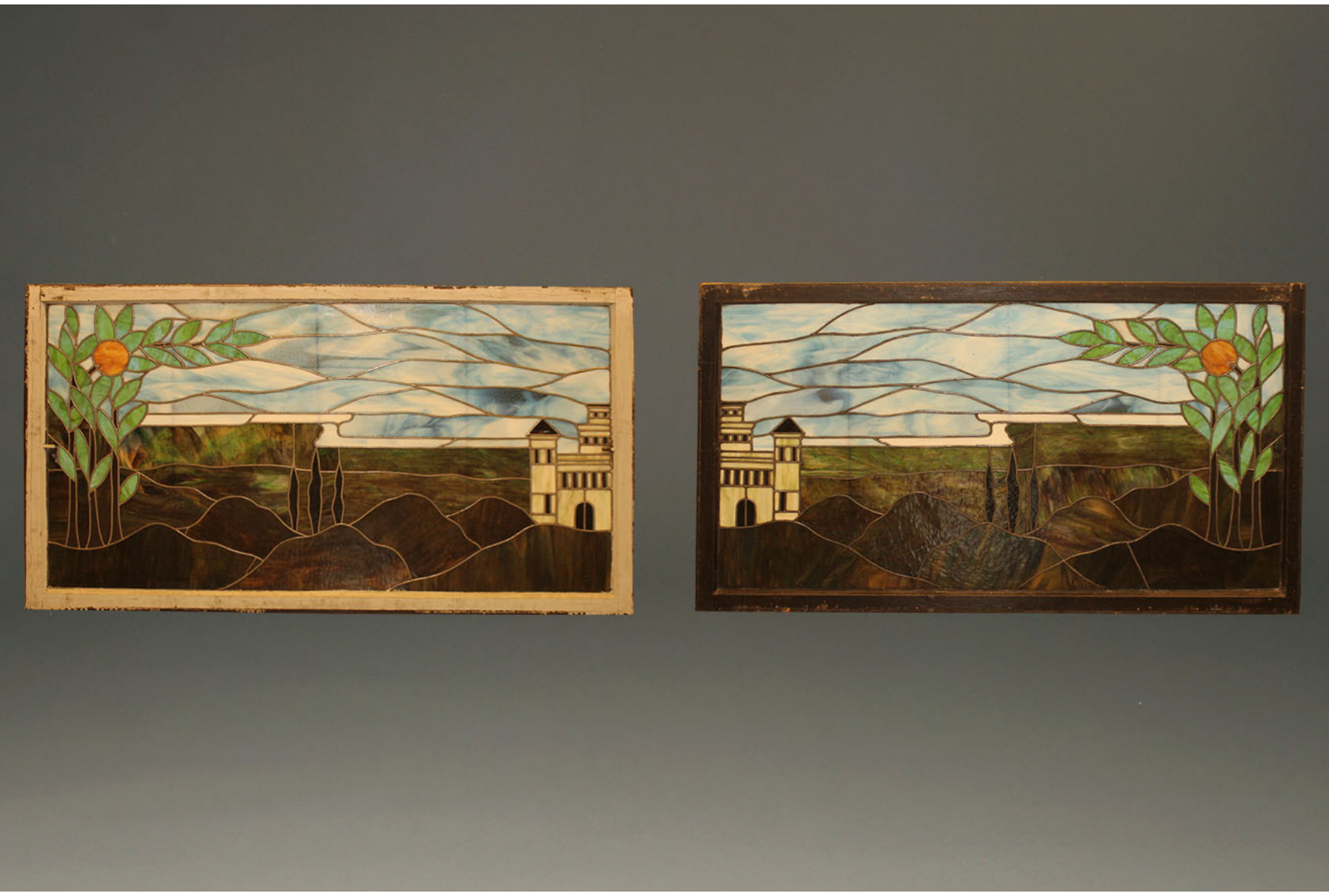
Pair of late 19th century mirror image stained and leaded glass panels depicting a castle, circa 1890.