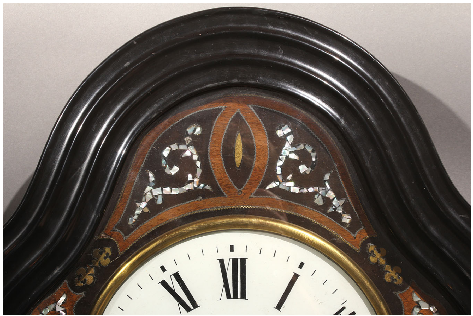
Late 19th century French Morez picture frame clock with mother of pearl details