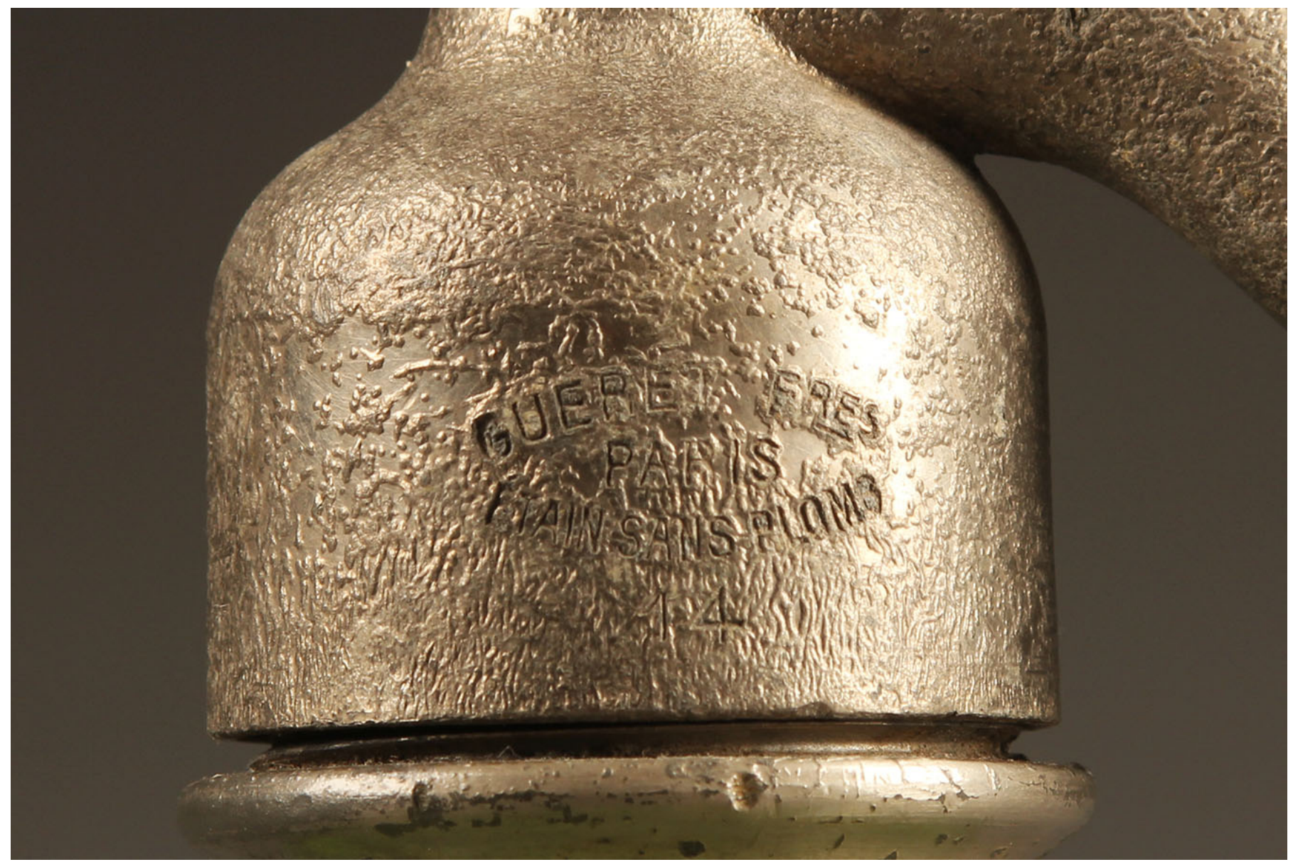
Green seltzer water bottle with etched design from France, circa 1920's.